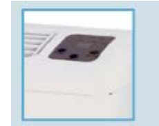
Digital Control Panel with RH display