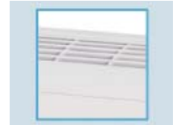
Moving Air Supply grill

The D950E is a medium large size, floor standing or wall mounting condensation dehumidifier, designed for large floor area application. It is a general purpose machine for controlling medium range humidity. It has an good air circulation versus drying capacity ratio. As such no messy duct work is required when this unit is used. Unlike larger models which have very large drying capacity, which require air distribution channels like duct work to convey the dry air from one part of the room to another, the D950 covers good range of floor area. The strong blower circulates the dry air evenly. Therefore, it is ideal for large space dehumidification application. Multiple units are placed at strategic corners of a large space. Installation work is minimal, with no than a simple 230 VAC power supply and common drain pipe